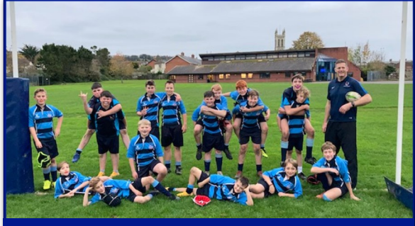
Year 8 Rugby, Won 8-7 against Uffculme School