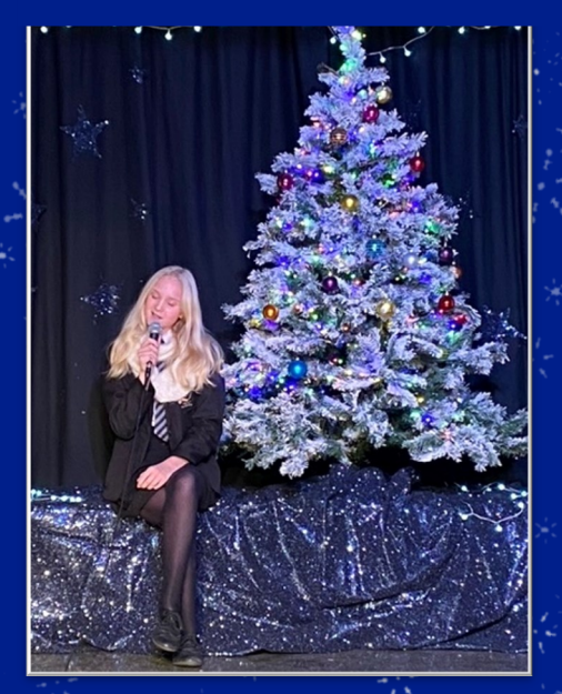
The link to the performances <a href="https://www.youtube.com/watch?v=bYuOMEOgIBQ">https://www.youtube.com/watch?v=bYuOMEOgIBQ</a>

Many thanks to the staff who made the recording possible and to the fabulous students involved for their commitment and resilience this term.