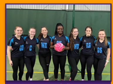
Post 16 Netball Team