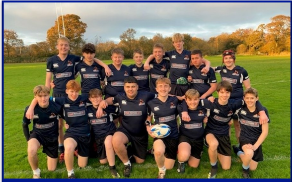
Under 16's Rugby, Won 38 - 31 against Colyton Grammar

Well done to the U13 Indoor Cricket squad who enjoyed a day at Exeter University on Thursday 11<sup>th</sup> November for the East Devon tournament. The quality of cricket improved throughout the day and there were some excellent individual and team performances.