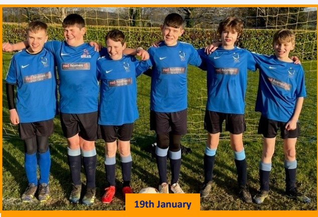
The U12 football team are through to the semi-finals of the East Devon Cup