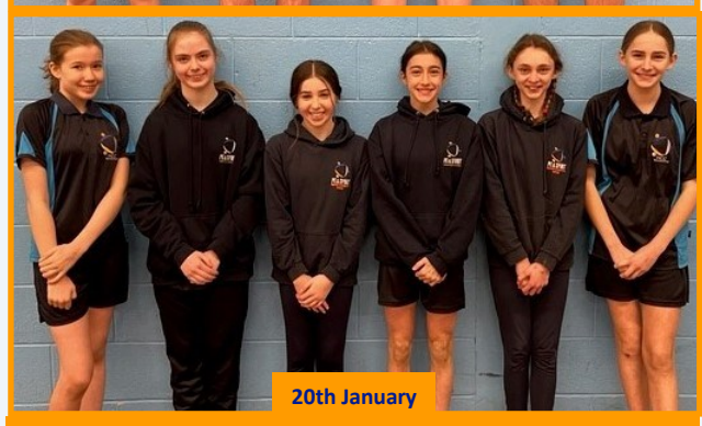
the Year 8 Indoor Athletics team who came 4<sup>th</sup> overall against East Devon Schools