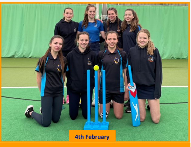
The U15 cricket teams enjoyed their first experience of a cricket tournament at Exeter University