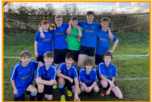
Tuesday 1st March Year 8 squad represented HCC at East Devon Football League. Lost 4, Won 1