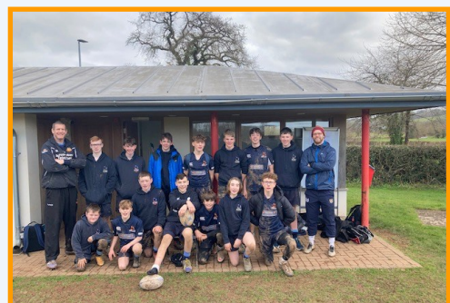
An outstanding performance from HCC boys Under 14s rugby players who played in East Devon Rugby Tournament, Won 4 Lost 1