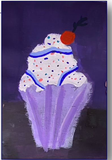
Year 7 Student painted this lovely cup cake