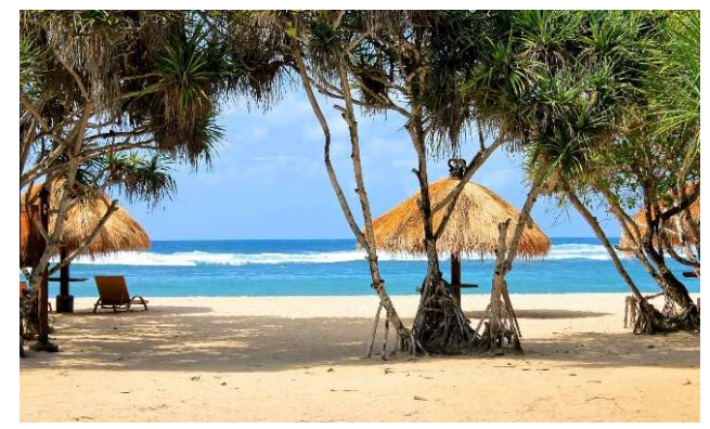
Bali - Indonesia.

My favourite place so far must be Bali in Indonesia. I spent 3 weeks here volunteering to teach. It was a great experience; the people were so friendly, and the beaches were amazing! Plus, it is so cheap over there.