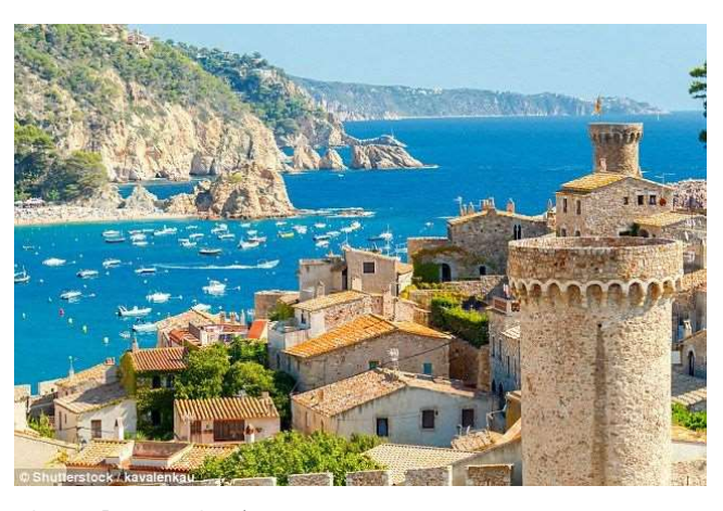
Costa Brava - Spain.

Overall, I would have to say Spain. I love Spain because I love the food and it is not too hot!